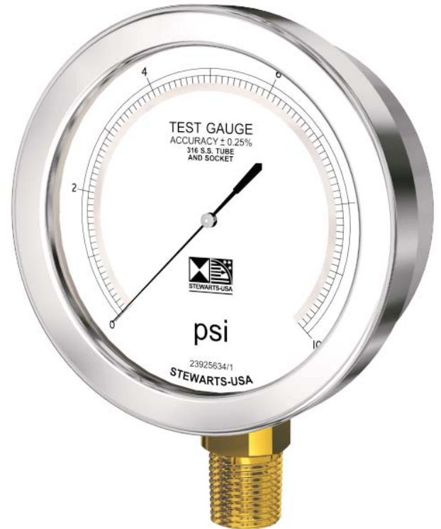
Model Shown: 45BT-10 To order other models by part no, See Below.

Additional Code Suffix for dual scale ranges (B = BAR/PSI) (K = KPA/PSI) ( \text{KgCm}^2 = \text{KgCm}^2 / \text{PSI} )