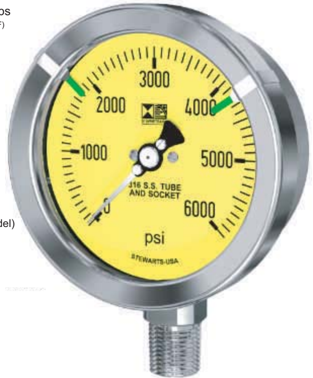
Model Shown: 41S-6K-G To order other models by part number, see below.