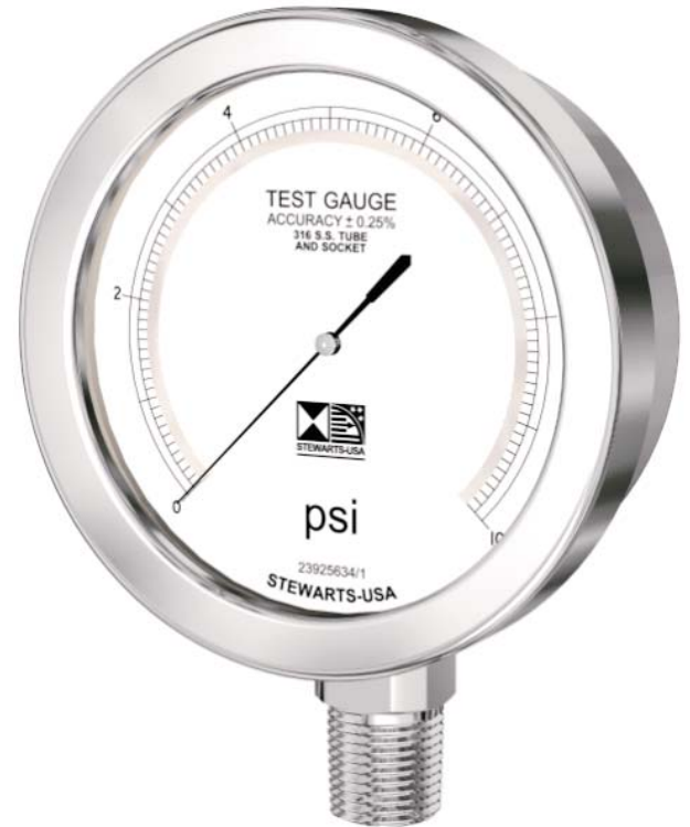
Model Shown: 45ST-10 To order other models by part no, See Below.

Standard Direct Mounted (Bottom Vertical). LB: Lower Back Connection. FP: Front Flange for Panel Mounting. C: C-Clamp Fixing for Panel Mounting. R: Rear Flange for Wall Mounting.